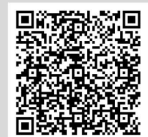
UCSJ QR Code