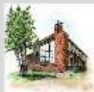
(Drawing courtesy of Dick Engdahl)